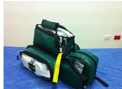
Equipment supplied to members